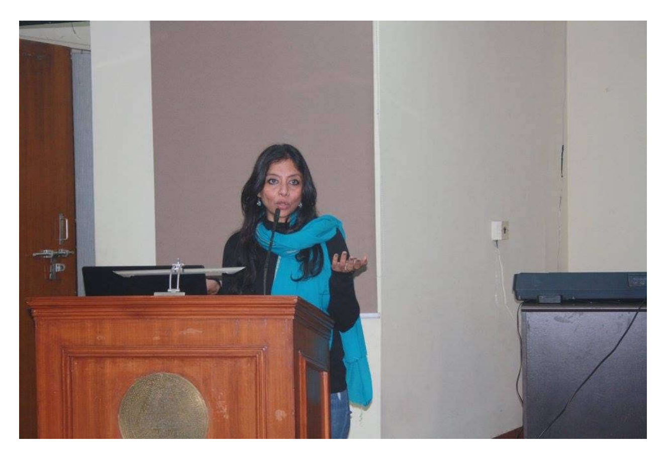
Photograph of the speaker at the event